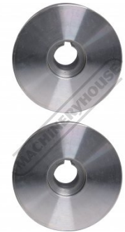
Wide Blank Rollers Front View