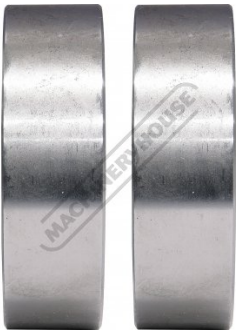
Narrow Blank Rollers Side Profile View