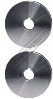
Narrow Blank Rollers Rear View