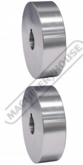
Narrow Blank Roller Set Rear View