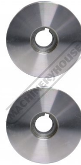
Narrow Blank Roller Front View