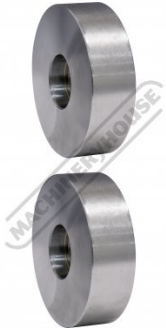
Narrow Blank Roller Set