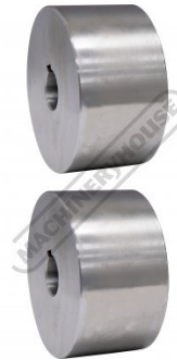
Wide Blank Roller Set Rear View