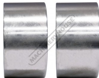
Wide Blank Roller Side Profile View