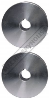
Wide Blank Rollers Rear View