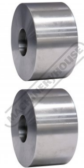
Wide Blank Roller Set