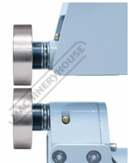
Shown on Machine Side View