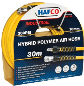
H009 Industrial Polymer Air Hose