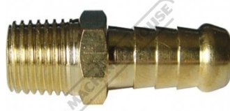
F803 Air Fittings