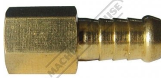
F811 Air Fittings