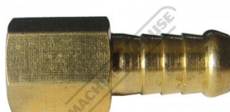
F811 Air Fittings