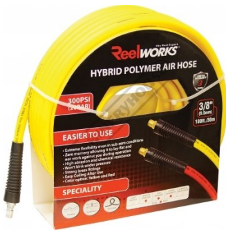
H018 Recoil PU Air Hose