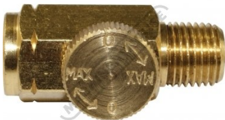
A219 Air Fittings