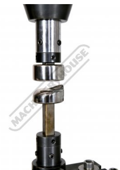
Hammer Die Holders