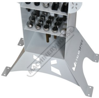
Sturdy Frame with Floor Mounting Holes