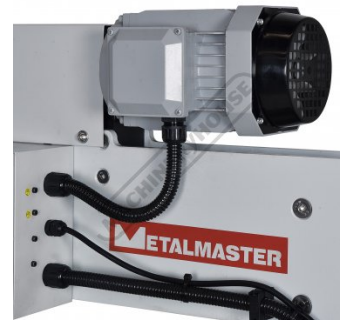
0.75kW / 1hp, 240V Motor