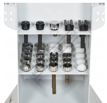
Die Holder Storage In Frame