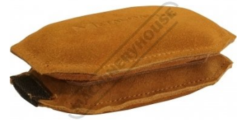
S214 Rectangle Leather Bag - Steel Shot Filled