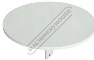
S2240 Round Steel Table for Sand Bag