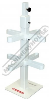
S2238 Steel Dolly Stand