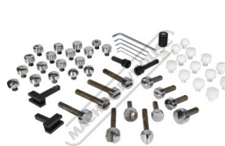
Includes Steel & Nylon Dies