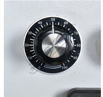
Variable Hammer Speed Dial