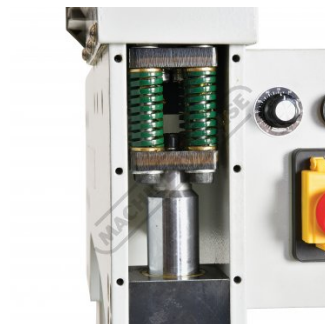
Spring Return Hammer