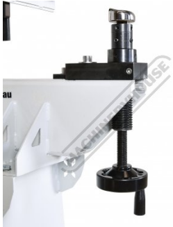
Die Height Adjustment