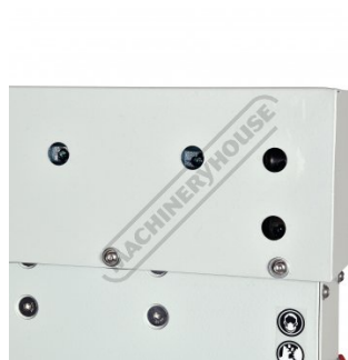
Grease Nipple Points