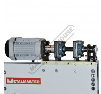
Motor Coupling Drive Mechanism