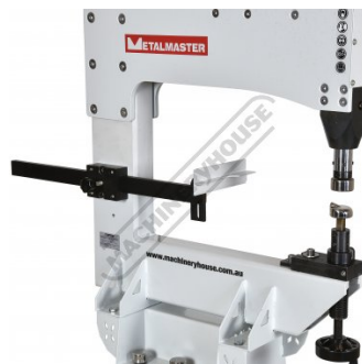
Adjustable Depth Stop Length