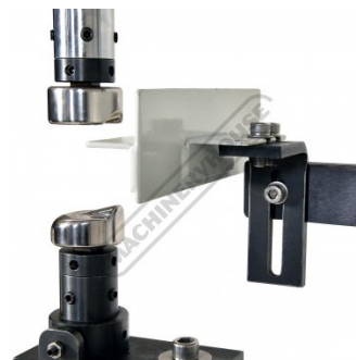
Adjustable Depth Stop Height