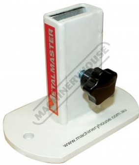
S2239 Dolly Stand Holder