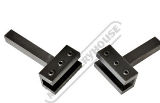
Custom Die Holders