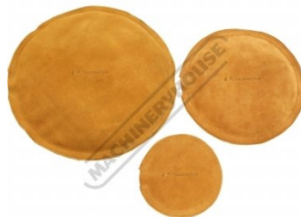
S210 Round Leather Bags - Sand Filled