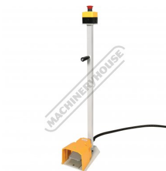
Foot Control with Emergency Stop