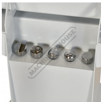
Quick Access Die Holders