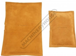
S212 Rectangle Leather Bags - Sand Filled