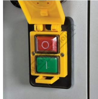
Safety magnetic Power Switch