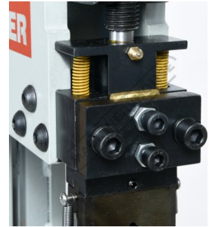
Top Die Holder