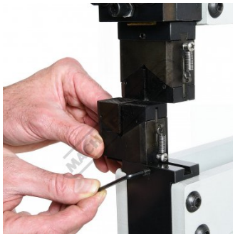
Dovetail Dies For Quick Self Aligning