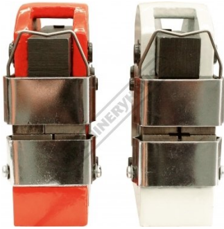
Shrinker & Stretcher Close Up