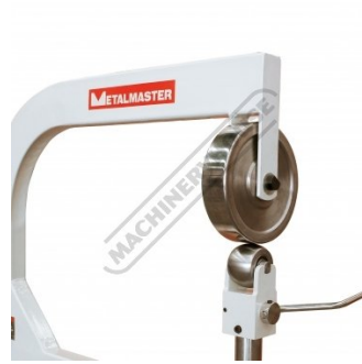
Cam Action Lever Tension