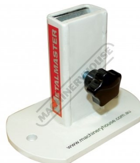
S2239 Dolly Stand Holder