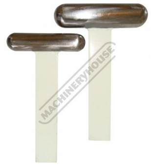
S2231 Straight Steel T-Dolly Set Large