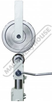
Roller End View Close Up