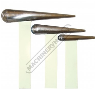
S2232 Tapered Steel T-Dolly Set