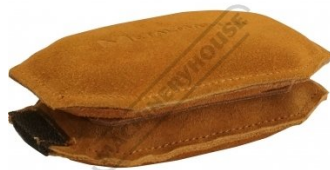
S214 Rectangle Leather Bag - Steel Shot