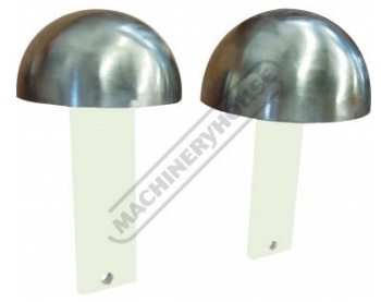
S2235 Mushroom Steel Dome Dolly Set