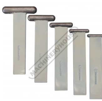
S223 Straight Steel T-Dolly Set Small