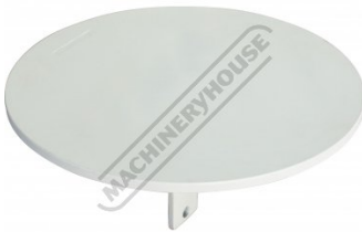
S2240 Round Steel Table for Sand Bag