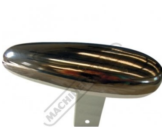
S2236 Oval Steel Dolly