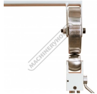
Roller Front View Close Up