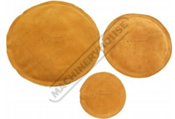
S210 Round Leather Bags - Sand