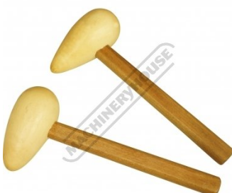
H892 Hard Maple Wood Bossing Mallet Set - Radius Ends