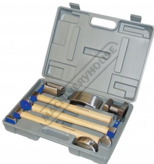
H885 Auto Panel Restoration Kit - DIY