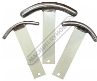
S2233 Curved Steel Dolly Set