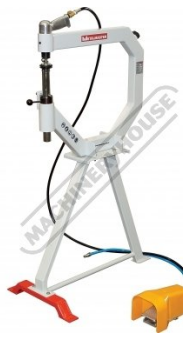
S227A Pneumatic Planishing Hammer