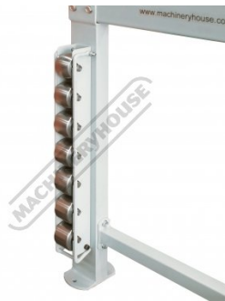
Roller Storage Rack