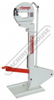
S2266 Foot Operated Shrinker Stretcher - Heavy Duty