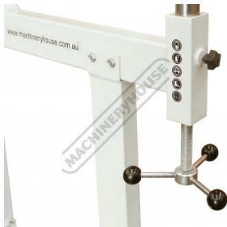
Material Thickness Hand Screw Adjustment