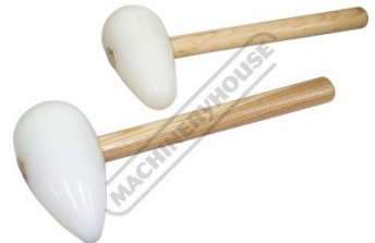
H890 Nylon Bossing Mallet Set - Radius Ends