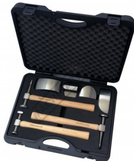
H886 Auto Panel Restoration Kit - Professional