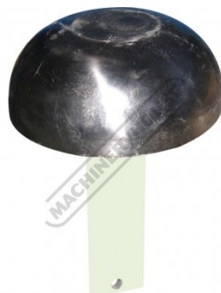
S2237 Bowl Steel Dome Dolly