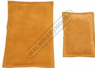
S212 Rectangle Leather Bags - Sand