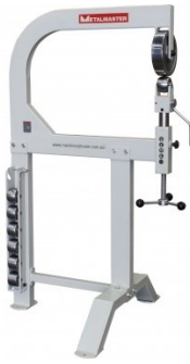
S225 English Wheel