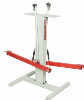
S2263 Shrinker Stretcher Foot Operated Stand