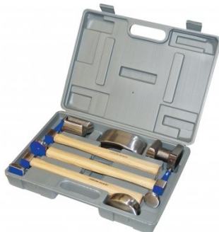
H885 Auto Panel Restoration Kit - DIY