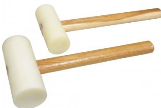
H893 Nylon Mallet Set - Flat Ends