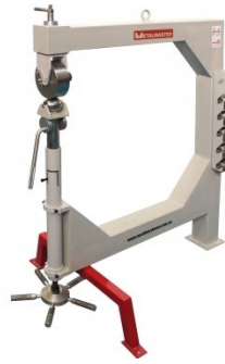
S2257 English Wheel - Heavy Duty