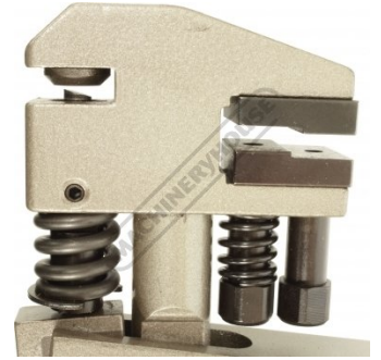
Hole Punch Side View