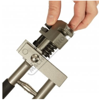
Swivel Head Action