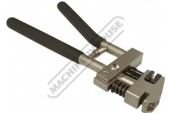
Hole Punch Top View