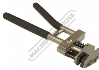
Crimp Flange Top View