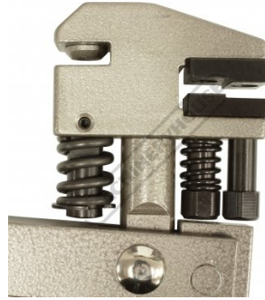
Head Side View