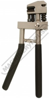
Hole Punch Set Up