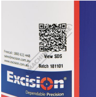
QR Code Material Safety Data Sheet