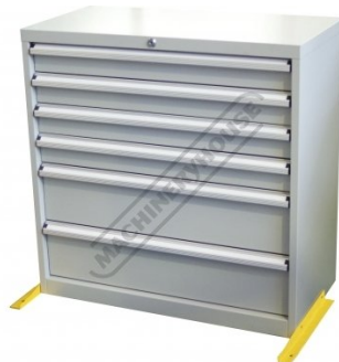
T775 Industrial Tooling Cabinet