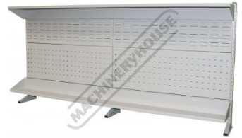
A426 Industrial Backing Panel - Bench Mount