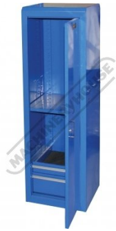
T726 Industrial Series Side Locker