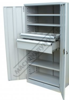
T762 Industrial Storage Cabinet