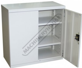
T774 Industrial Storage Cabinet