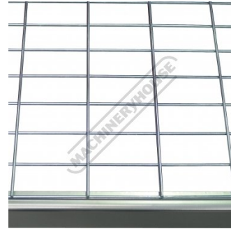
Shelf Wire Mesh