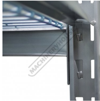
Internal Shelf Locking Wedge Type System