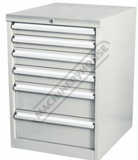
T764 Industrial Tooling Cabinet