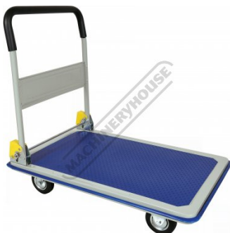
T670 Platform Trolley - 300kg Capacity