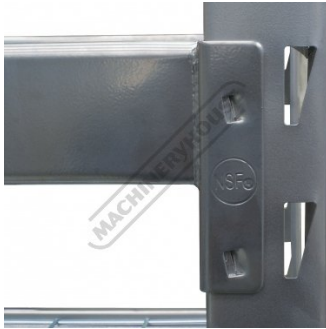
External Shelf Locking System