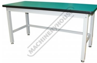
A420 Industrial Work Bench