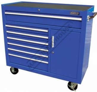
T724 Industrial Series Roller Cabinet