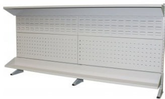
A426 Industrial Backing Panel - Bench Mount