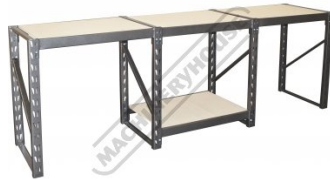
Single Unit Configuration Work Bench