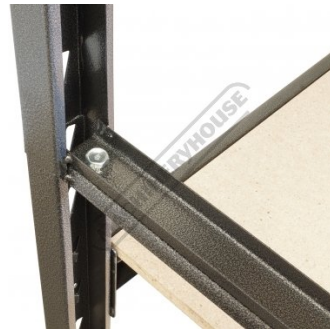
Vertical Frames Bolt Together