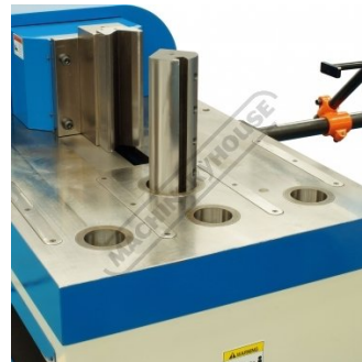
Table with Posts Removed for Optional Attachments