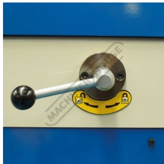
Main Post Release Lock Lever