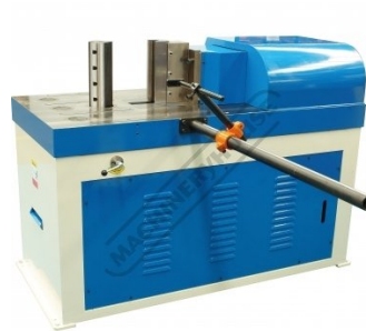
1000mm Manual Backgauge