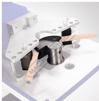
P1607 1-1/2" Pipe Bender Former Set