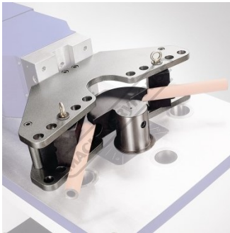
P1601 Pipe Bender Attachment