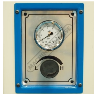
Pressure Adjustment Dial and Gauge