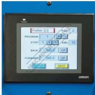
Touch Screen NC Control