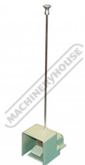
Roving Foot Pedal