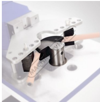
P1602 3/8" Pipe Bender Former Set