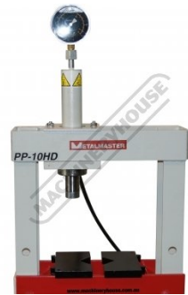
Sliding Ram Left Side