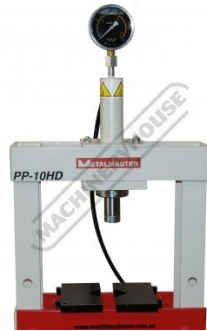
Sliding Ram Centre