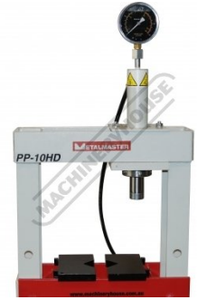
Sliding Ram Right Side