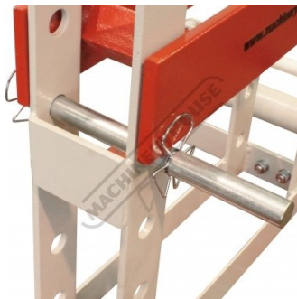
Table Height Adjustment Bars with Safety Clips