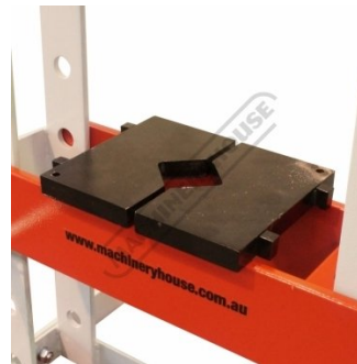
Bending Plates Shown Flat