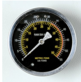
Metric / Imperial Pressure Gauge