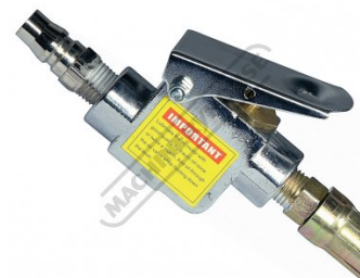
Pneumatic Valve Control