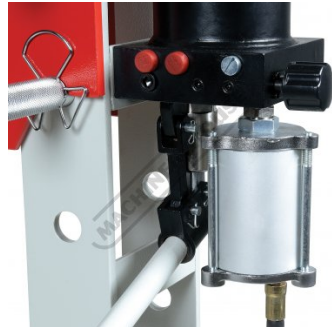
Hydraulic Pneumatic Hand Pump