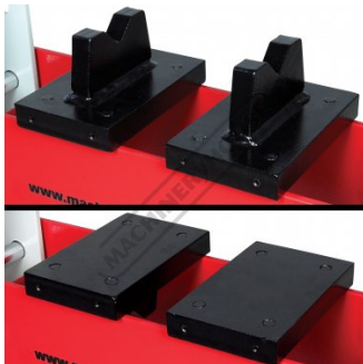
Dual Purpose Pressing Blocks