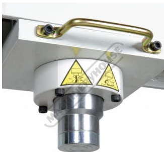
Sliding Ram With Handle