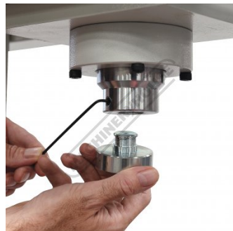
Includes Removable Ram Top Cap