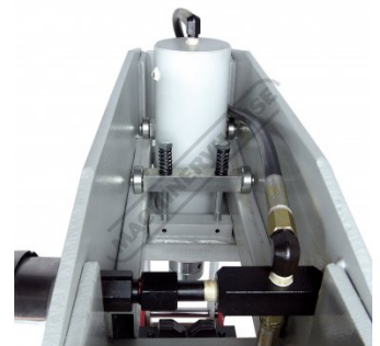
Ram Top View With Bearing Slide