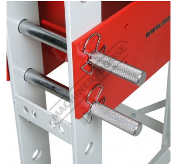
Table Pins With Safety Clips