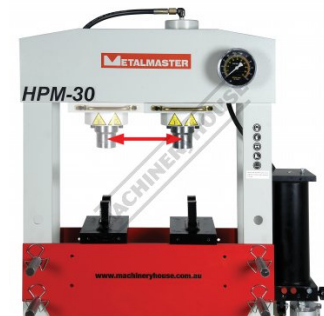
Horizontal Sliding Ram