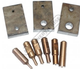
Punch Dies 3 10mm