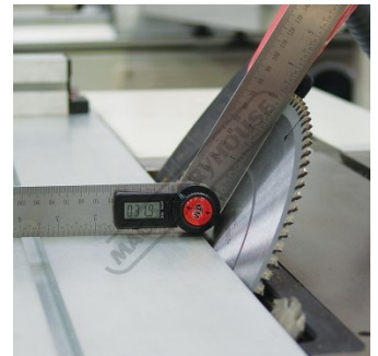
Shown Measuring Blade Angle