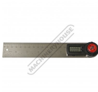
Zero degree view