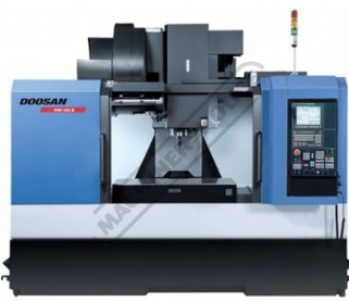
DNC 750 II Side Open