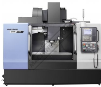
DNC 5700 Front Open