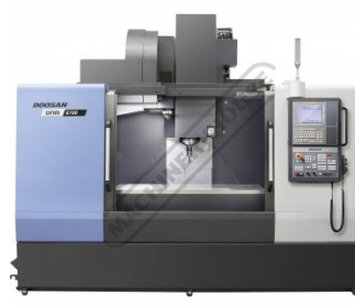
DNC 6700 Front Open