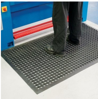
Shown Being Used with a Lathe