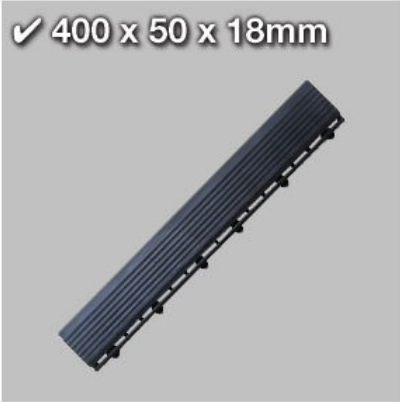
✓ 400 x 50 x 18mm