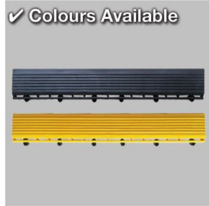
✓ Colours Available