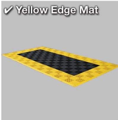
✓ Yellow Edge Mat