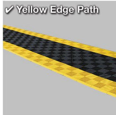
✓ Yellow Edge Path