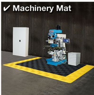
✓ Machinery Mat