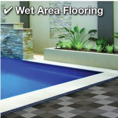
✓ Wet Area Flooring