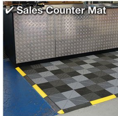
✓ Sales Counter Mat