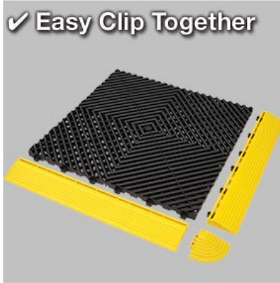
✓ Easy Clip Together