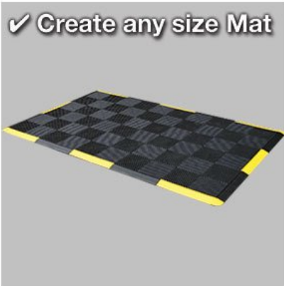
✓ Create any size Mat