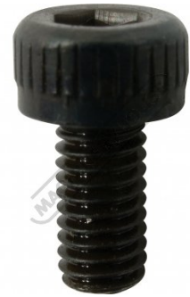
L540 Screw Seat to Suit Threading Tool Holders