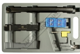
L459 Lathe Threading Tool Kit - Insert Type