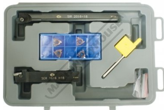
L457 Lathe Threading Tool Kit - Insert Type