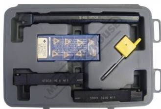
L451 Lathe Turning Tool Kit - 3 piece Insert Type