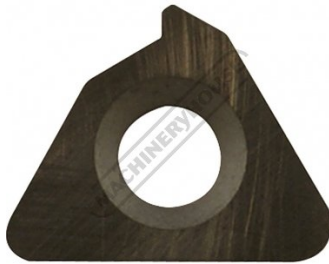
L537A Seat to Suit Internal Threading Tool Holders