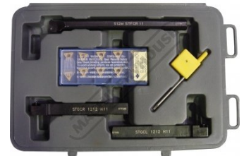
L450 Lathe Turning Tool Kit - 3 piece Insert Type