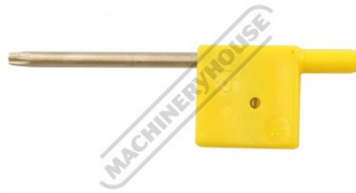
L538 Key to Suit Tool Holder