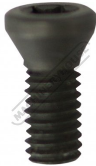
L539A Screw to Suit Threading Tool Holders