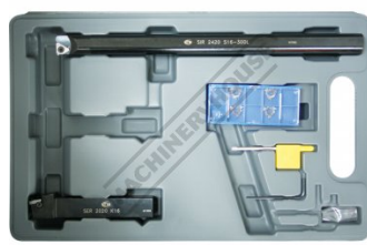
L458 Lathe Threading Tool Kit - Insert Type