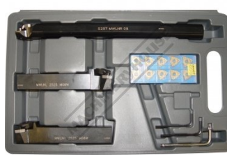
L453 Lathe Turning Tool Kit - 3 piece Insert Type