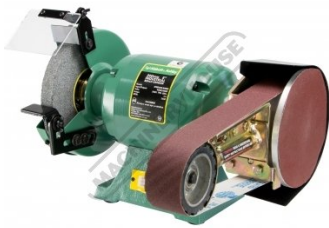
Shown Fitted to a Optional Bench grinder