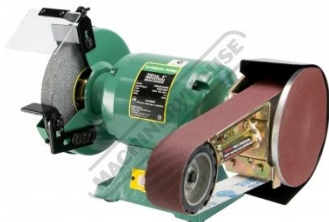
G160 Industrial Bench Grinder