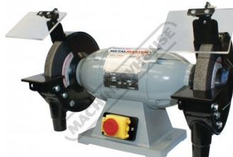
G161A Industrial Bench Grinder