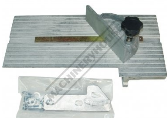
L083 Multitool Chisel Sharpening Jig