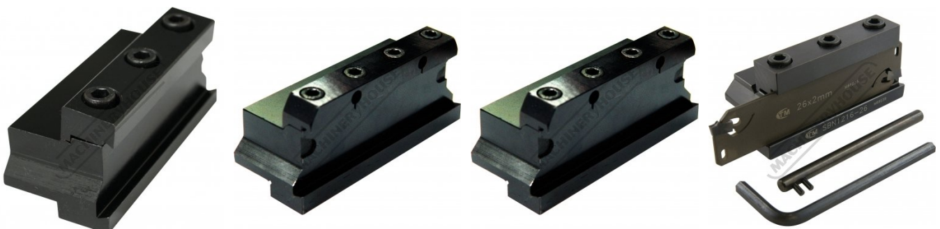
L464 Professional Lathe Parting Tool Kit - Insert Type