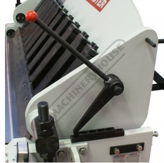
Top Beam Support Stop Lever