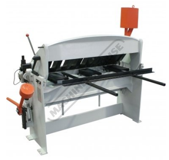
Rear Back Gauge