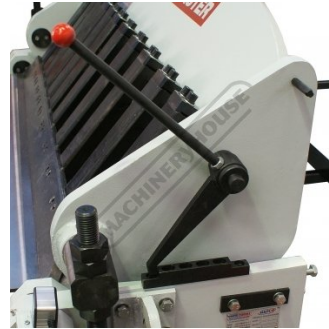
Top Beam Support Stop Lever