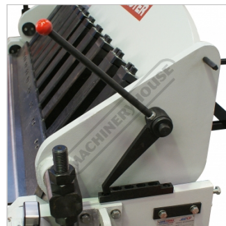
Top Beam Support Stop Lever