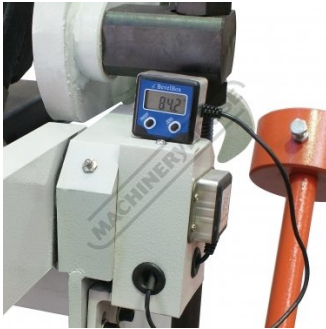
Digital Angle Readout