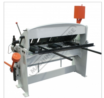
Rear Back Gauge