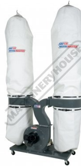
W331 Industrial Dust Collector