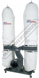
W397 Industrial Dust Collector