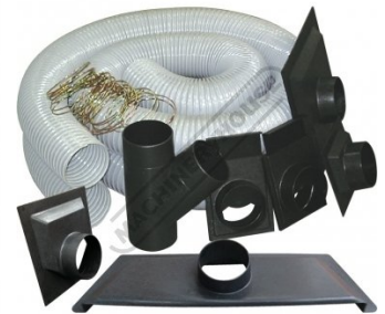
W344 Timber Dust Accessory Kit