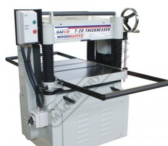
Robust 4 Post Design