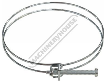
W341 Dust Hose Clamp