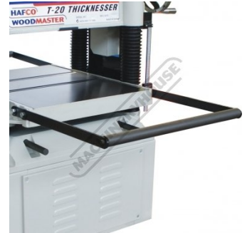
Roller Material Supports