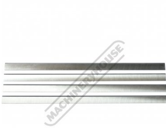
WL005 BLADE SET HSS PKT 4