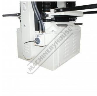
Heavy Duty Base