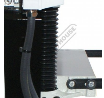
Protective Concertina Covers