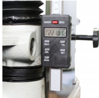
Digital Height Readout