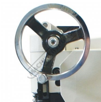
Height Adjustment Handle