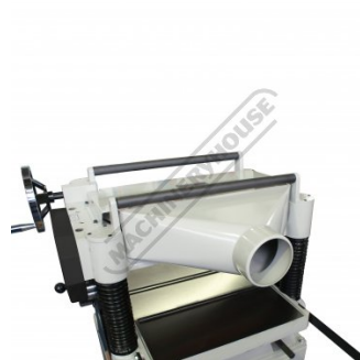
125mm Dust Chute and Top Material Slide Rollers