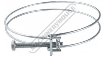
W340 Dust Hose Clamp