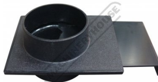
W335 Dust Hose Shut Off Valve