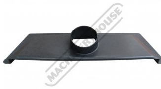
W339 Dust Hose Floor Sweeper Attachment