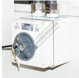
Key Lockable Switch