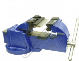
Shown Set Up on a Vice