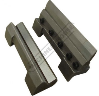
VB-125 Bench Vice Brake