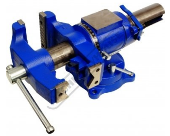
Rotating Vice with Pipe Jaws