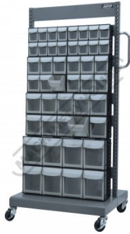
Few Buckets Shown Open