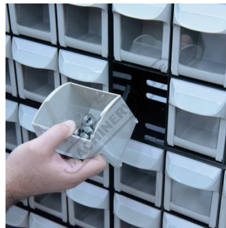
Removable Bins For Easy Access & Refilling