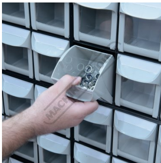
Removable Bins For Easy Access & Refilling