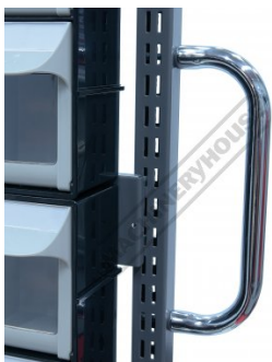
Chrome Handle Mounts on Left or Right Side