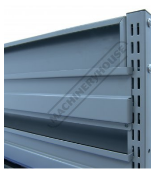
Optional Bracket Securely Clipped Onto Frame