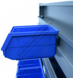
Optional Bucket Shown Clipped Onto Bracket