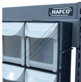
46 x Bins, Small, Medium, Large & Extra Large Sizes