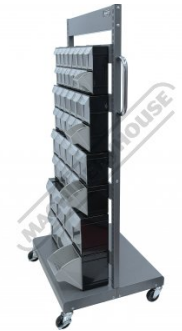
Right Side Top View Buckets Open