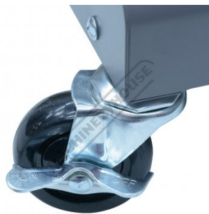
2 x Swivel Wheels with Brake