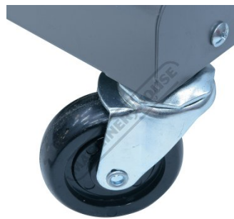
2 x Swivel Wheels