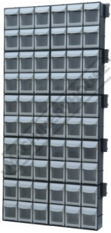
S0353 Parts Storage Bin System