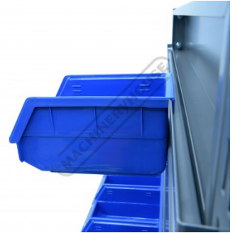
Optional Bucket Shown Clipped Onto Bracket