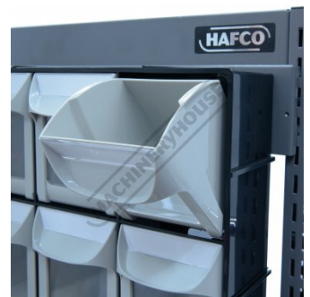
Bin Opened To 40° Angle