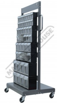
Right Side View Two Buckets Open