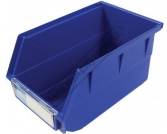
A434 Plastic Bucket