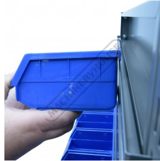
Optional Bucket Shown Clipped Onto Bracket