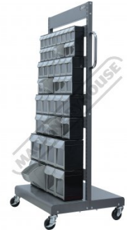
Right Side View Few Buckets Open