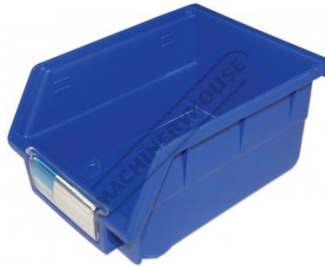
A432 Plastic Bucket