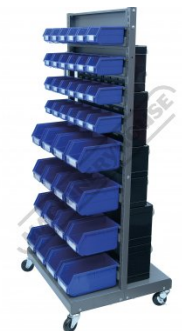
Shown with Optional Buckets A432, A434, A436