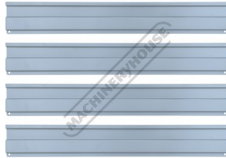
S0357 4 x Brackets To Mount Plastic Buckets