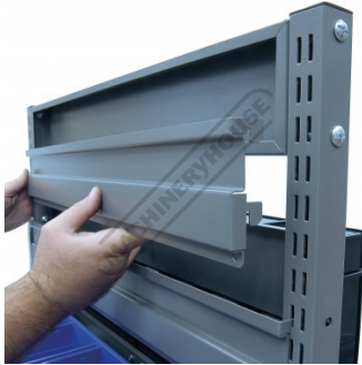
Optional Bracket Shown Clipping Onto Frame