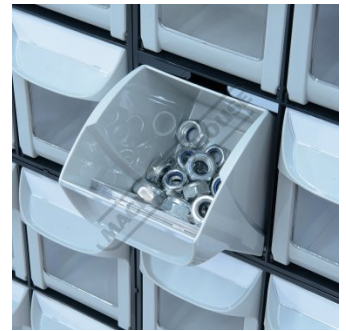
Bins Open Smoothly To a 40° Angle