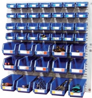
Tools Not Included