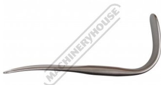
Angle and Flat Short Double Spoon