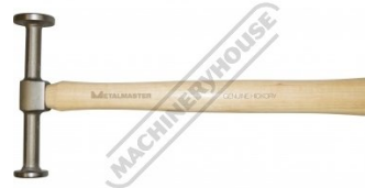
Fender and Panel Dinging Hammer