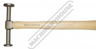
Fender and Panel Dinging Hammer