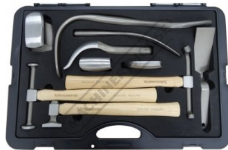
Shown in Box