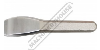
Drip Moulding Spoon