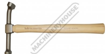
Door Skin Hammer