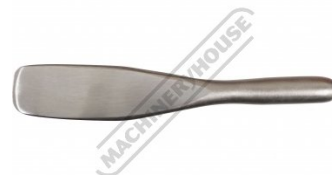
Short Single Spoon