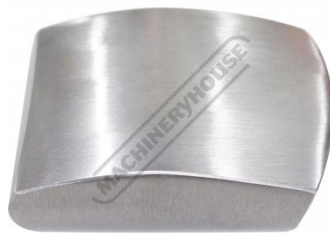
High Crown Dolly