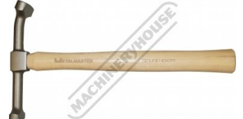
Door Skin Hammer