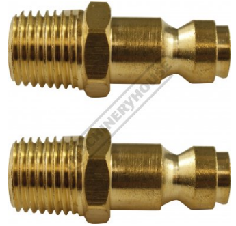
F902B Air Fittings