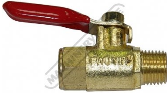
F930 Air Fittings