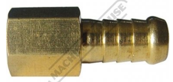
F811 Air Fittings