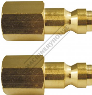
F903B Air Fittings