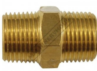
F864 Air Fittings