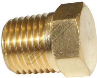
F870 Air Fittings