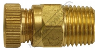
A242 Air Fittings