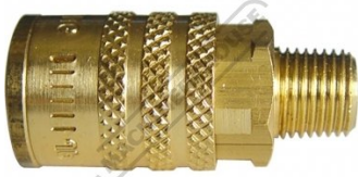
F901 Air Fittings