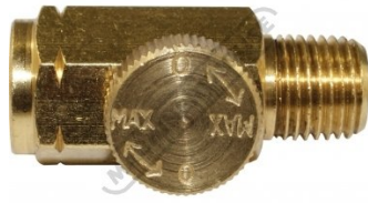
A219 Air Fittings