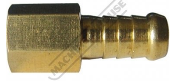
F811 Air Fittings