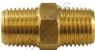
F860 Air Fittings