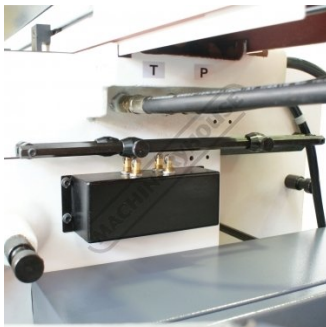
Table Direction Micro Switches