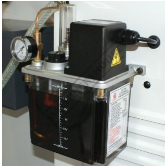
Auto Lubrication Pump