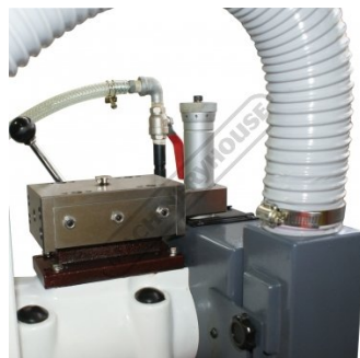
Parallel Wheel Dresser Micro Adjustment