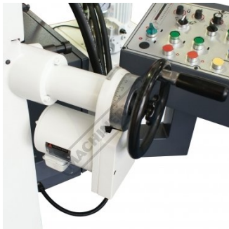
Fine Feed Height Adjustment Dial