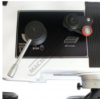
Hydraulic Table Feed Control with Rapid