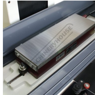
Electro Magnetic Chuck