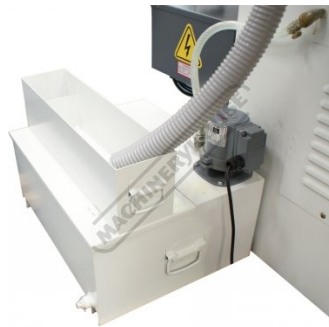
Coolant Pump & Tank