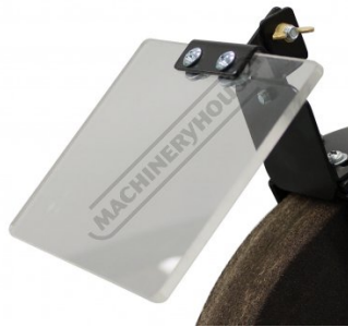
Adjustable Eye Shields