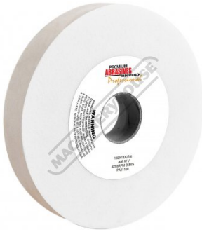
G171 White - Alox Grinder Wheel