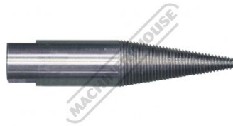
G184B Tapered Buffering Spindle - Right Hand