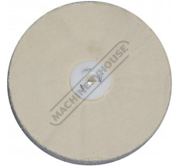
G186A Buffing Mop