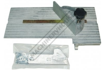
L086 Multitool Tilting Table & Mitre Guide