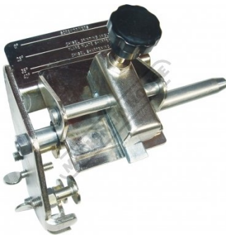
L083 Multitool Chisel Sharpening Jig