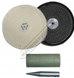
G185 Buffing Kit