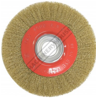
G188 Grinder Wire Wheel - Crimped