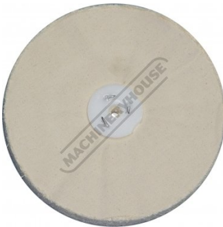
G186A Buffing Mop