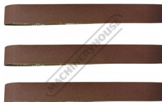
A8000 40G Aluminium Oxide Linishing Belt Pack