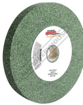
G170 Silicon Carbide Grinder Wheel