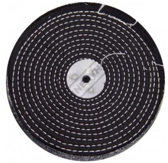
G186 Buffing Mop