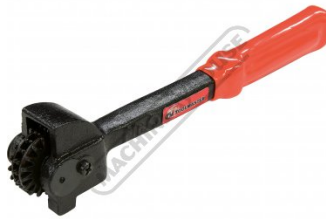
G189A Grinding Wheel Dresser - Rotary Cutter Type