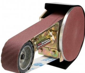
L085 Multitool Belt & Disc Linishing Attachment