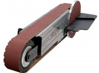
L0912 Industrial Belt & Disc Linishing Attachment