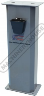
G182 Bench Grinder Stand