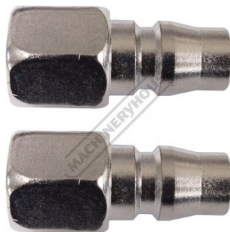
F950 High-Flow Air Fittings