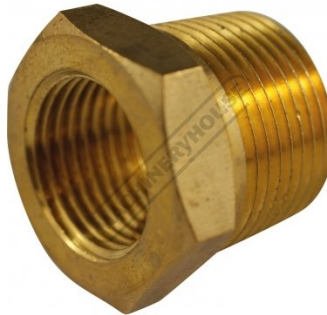
F842 Air Fittings