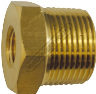
F838 Air Fittings