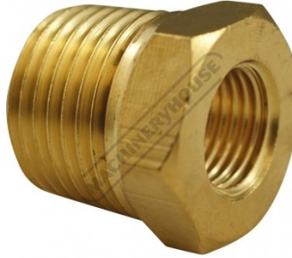
F834 Air Fittings