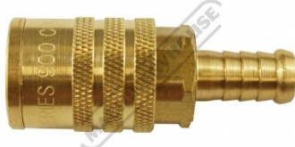
F912 Air Fittings