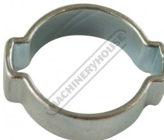
F888 Air Fittings