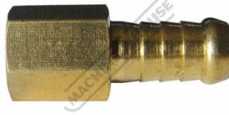
F811 Air Fittings