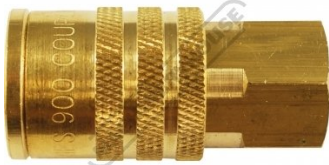
F900 Air Fittings