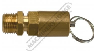
A240 Air Fittings