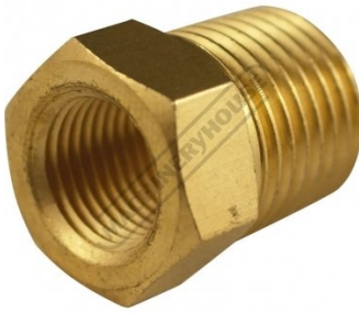
F830 Air Fittings