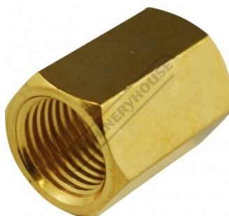
F845 Air Fittings