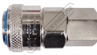
F940 High-Flow One Touch System Air Fittings