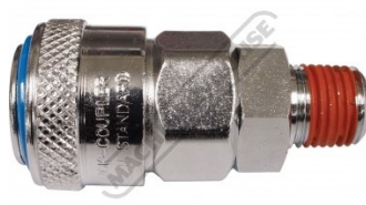
F941 High-Flow One Touch System Air Fittings