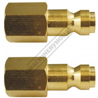
F903B Air Fittings