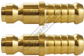
F906A Air Fittings