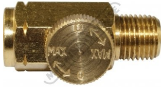
A219 Air Fittings