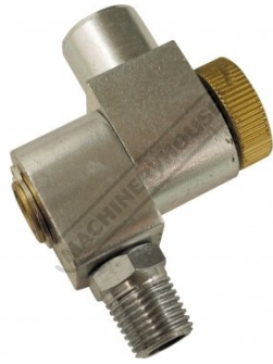
F800 Air Fittings