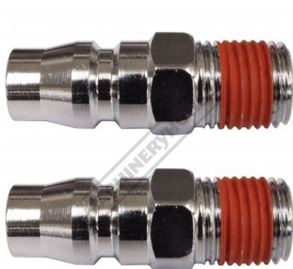
F951 High-Flow Air Fittings