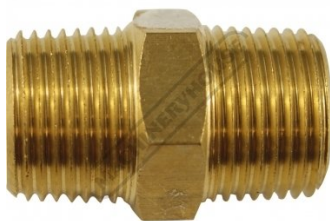
F864 Air Fittings