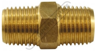
F860 Air Fittings