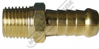
F803 Air Fittings