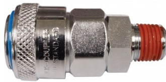
F941 High-Flow One Touch System Air Fittings