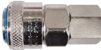
F945 High-Flow One Touch System Air Fittings