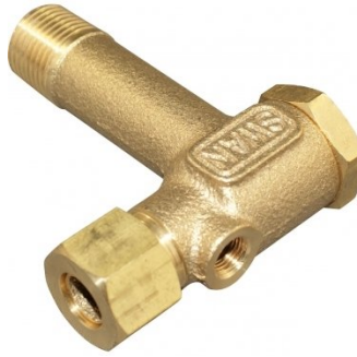
A230 Air Fittings