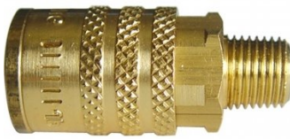
F901 Air Fittings