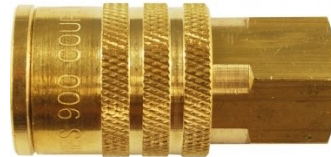
F900 Air Fittings