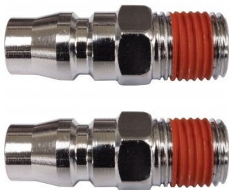
F951 High-Flow Air Fittings