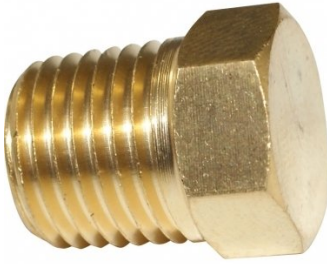
F870 Air Fittings