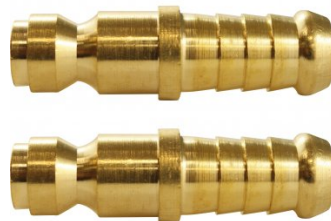
F906A Air Fittings