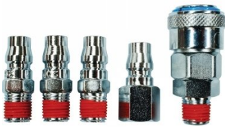
F935 High-Flow Air Fittings