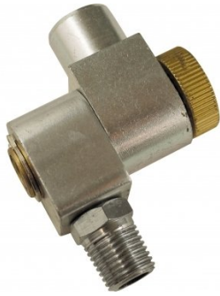
F800 Air Fittings