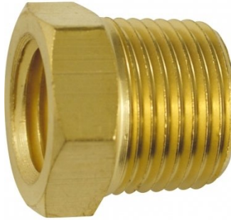
F832 Air Fittings