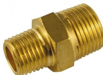
F862 Air Fittings