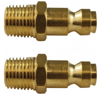
F902B Air Fittings