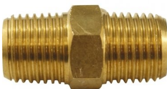
F860 Air Fittings