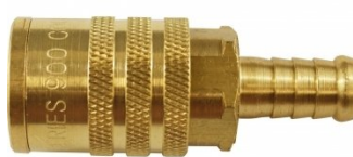
F912 Air Fittings