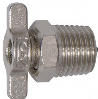
A242 Air Fittings