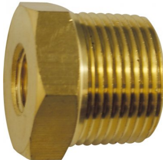
F838 Air Fittings