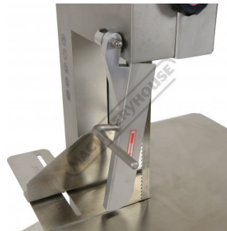
Blade Guard Down