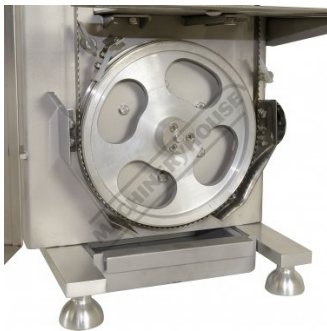
Bottom Blade Wheel