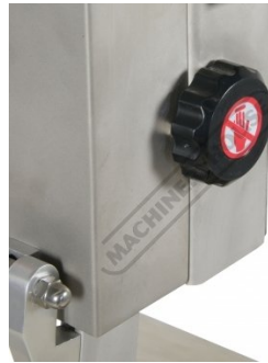
Blade Guard Door Handle