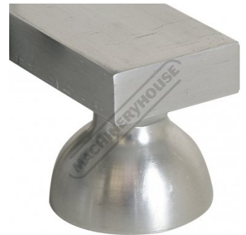
Stainless Steel Feet