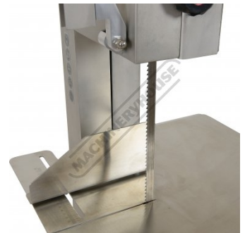
Adjustable Length Stop Guide