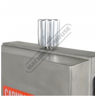
Blade Tension Handle

sales@machineryhouse.com.au www.machineryhouse.com.au