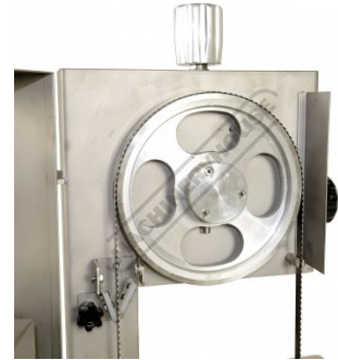
Top Blade Wheel