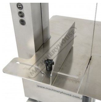
Length Stop Guide