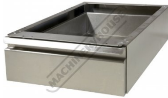
F310 Stainless Steel Drawer - Mounts Under Bench