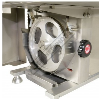
Bottom Blade Wheel Setup