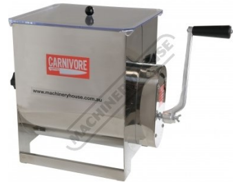
F340 Mince Mixer - Stainless Steel