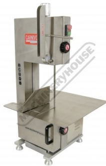
Top View Guard Up