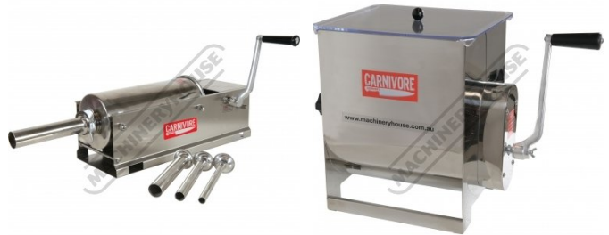
F340 Mince Mixer - Stainless Steel