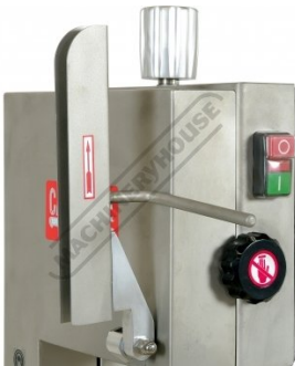
Blade Guard Up