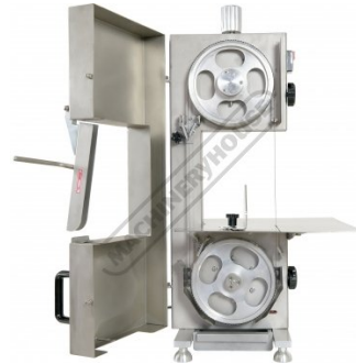
Side View With Blade Guard Open