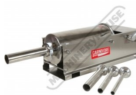
F355 Sausage Stuffer - Stainless Steel