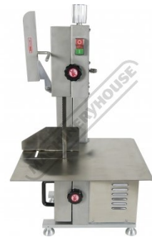
Side View Guard Up