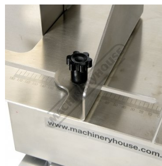
Length Stop Graduations