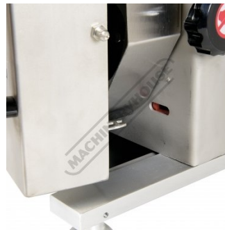
Safety Micro on Blade Guard