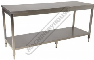
F280 Stainless Steel Island Work Bench