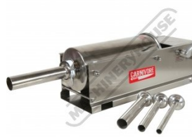
F355 Sausage Stuffer - Stainless Steel