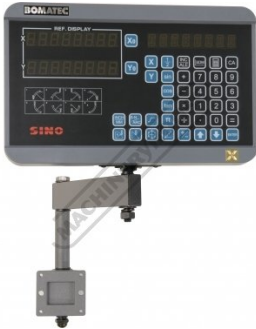
Shown Mounted to Optional DRO