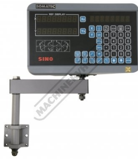
Shown Mounted to Optional DRO Front View