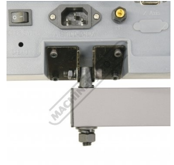
Mounting Close Up with Optional DRO