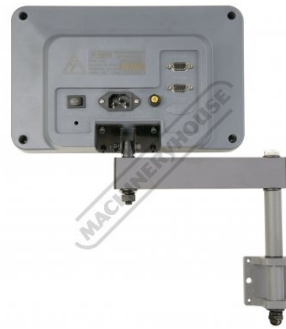
Shown Mounted to Optional DRO Rear View