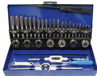
T012 Metric Alloy Steel Tap & Die Set - 32 Piece