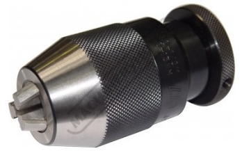
C292 Industrial Drill Chuck - Keyless Type