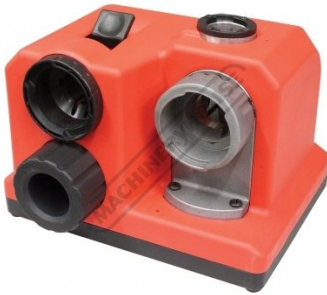
D070 Drill Sharpener