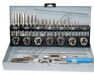
T013 Metric HSS Tap & Die Set - 32 Piece