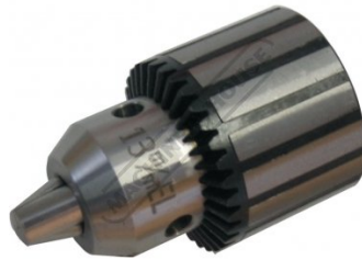
C289 Heavy Duty Drill Chuck - Keyed Type