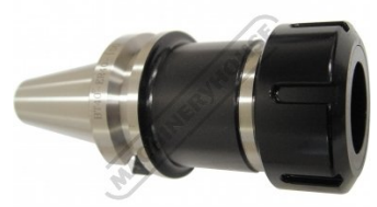
T228 BT40 x ER40-100 Collet Chuck