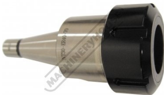
C111 Collet Chuck - NT30 x ER40