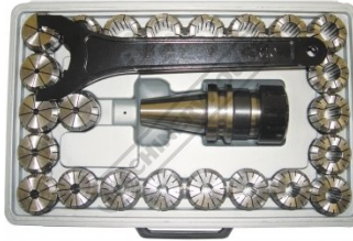
C967 Collet & Chuck Set - 25 Piece