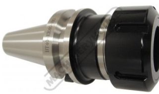
T226 BT40 x ER40-80 Collet Chuck