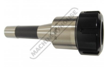
C138 Collet Chuck R8 x ER40