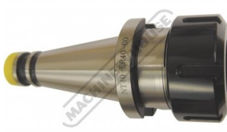
C114 Collet Chuck NT40 x ER40