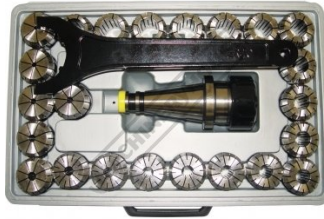
C967 Collet & Chuck Set - 25 Piece