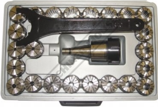
C966 Collet & Chuck Set - 25 Piece