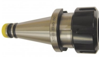
C114 Collet Chuck NT40 x ER40