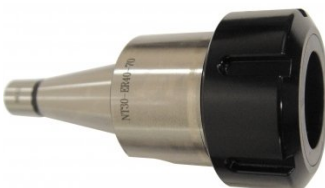
C111 Collet Chuck - NT30 x ER40