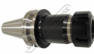
T448 BT50 x ER32-100 Collet Chuck