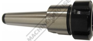
C105 Collet Chuck - 3MT x ER32