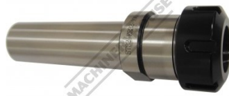
C931 32 x 100 x ER32 Collet Chuck - Straight