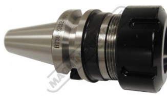
T332 BT30 x ER32-60 Collet Chuck