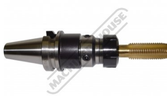
T007 BT40 x ER32 Floating Tap Holder