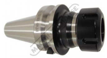
T220 BT40 x ER32-70 Collet Chuck