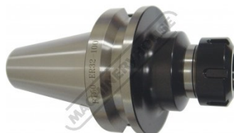
T448 BT50 x ER32-100 Collet Chuck