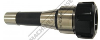
C106 Collet Chuck - R8 x ER32