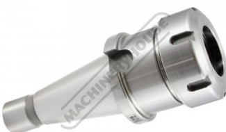
C110 Collet Chuck - NT30 x ER32