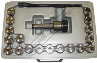
C926 Collet & Chuck Set - 20 Piece