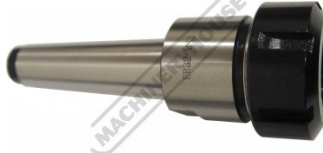
C105 Collet Chuck - 3MT x ER32