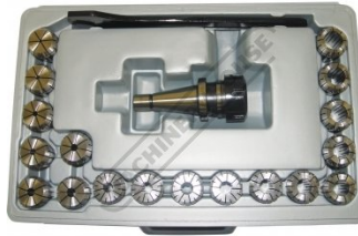
C928 Collet & Chuck Set - 20 Piece