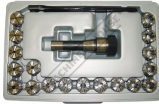
C927 Collet & Chuck Set - 20 Piece