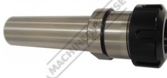
C931 32 x 100 x ER32 Collet Chuck - Straight