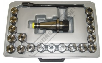
C929 Collet & Chuck Set - 20 Piece