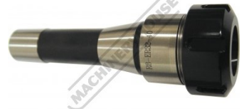
C106 Collet Chuck - R8 x ER32