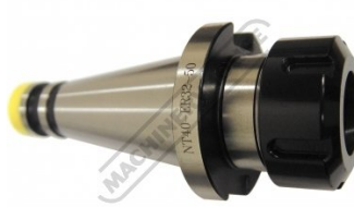
C112 Collet Chuck NT40 - ER32