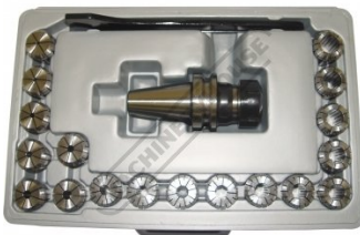
C929A Collet & Chuck Set - 20 Piece