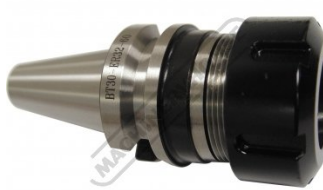
T332 BT30 x ER32-60 Collet Chuck