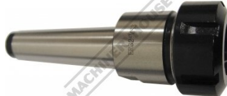
C106 Collet Chuck - R8 x ER32