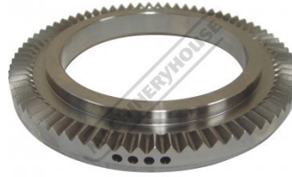
C2883 Replacement Scroll