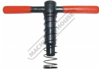
C2861 Chuck Key