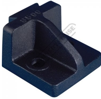
A358C Bolt Down Adaptor