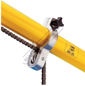
A358B Choker Collar