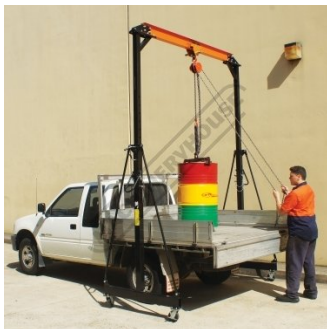
Shown Loading Oil Drum onto Ute