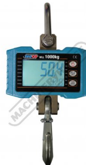
C191 Digital Crane Scale