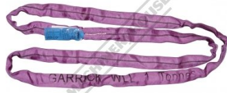
H308 Round Sling