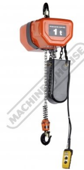
H260 Electric Chain Hoist