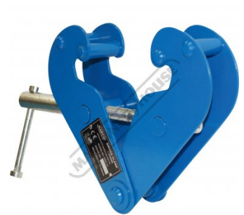
C146 Girder Clamp