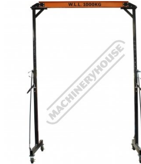
Shown at Full Height