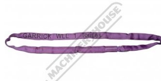
H300 Round Sling