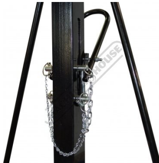
Support Pin Safety Chain with Lynch Pin Clips