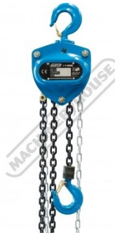
C144 Chain Block