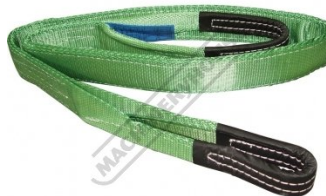
H322 Flat Sling