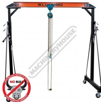
K088 Mobile Girder Rail Gantry Package Deal