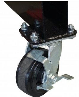
Swivel Wheels with Lock