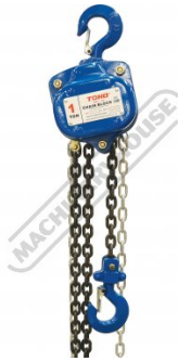
C180T Chain Block - Workshop Series