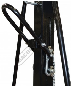
Safety Height Locking Pins