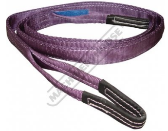
H320 Flat Sling