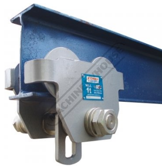
C181 Girder Trolley