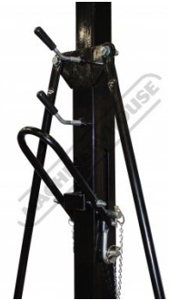
Lever Action Beam Height Adjustment