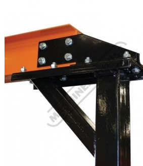
Heavy Duty Beam Support