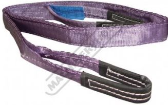
H318 Flat Sling