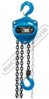
C143 Chain Block