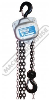
C180 Chain Block