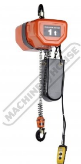
H261 Electric Chain Hoist