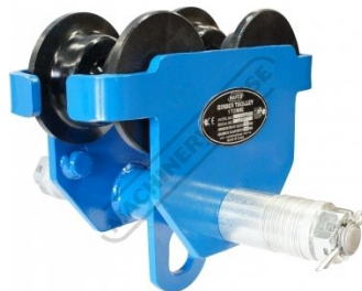
C147 Girder Trolley