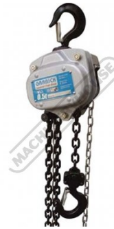
C179 Chain Block