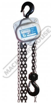
C180A Chain Block