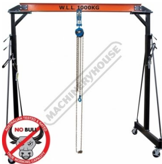
K090 Mobile Girder Rail Gantry Package Deal