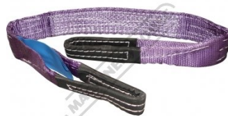
H316 Flat Sling