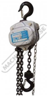
C179A Chain Block