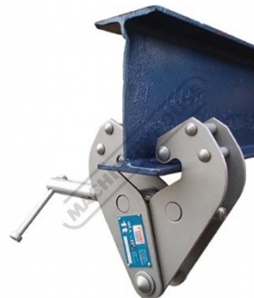
C176 Girder Clamp