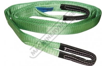
H324 Flat Sling