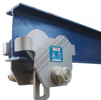
C181B Girder Trolley