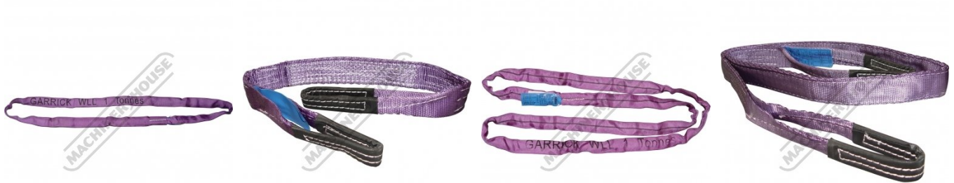
H308 Round Slings