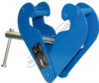
C146 Girder Clamp