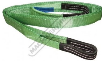
H322 Flat Sling