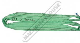
H312 Round Sling