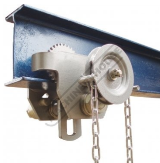
C181A Girder Trolley - Geared