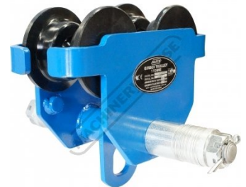
C147 Girder Trolley