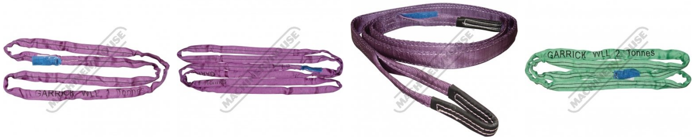
H310 Round Slings